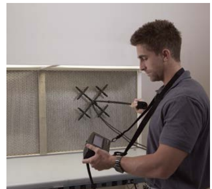
Plug and play thermoanemometer probes enables use in multiple applications.