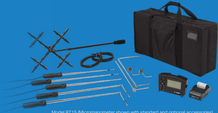
Model 8715 (Micromanometer shown with standard and optional accessories)

The 8380 AccuBalance® Air Capture Hood includes a detachable 8715 micromanometer—one of the most advanced, versatile, and easy to use micromanometers on the market today.