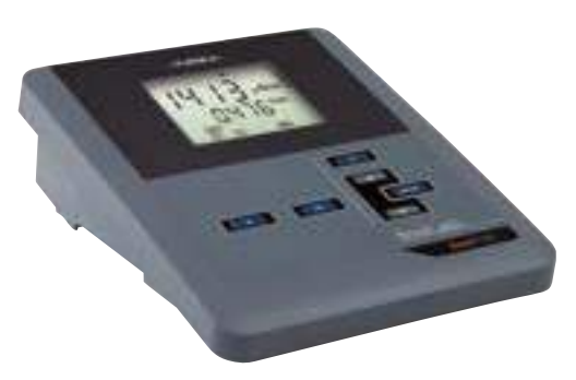
inoLab® Cond 7110