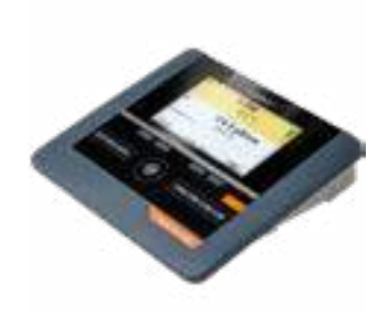
inoLab® Multi 9620 IDS