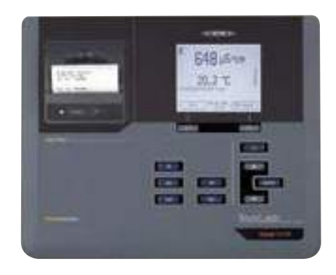
USB interface for rapid data transfer