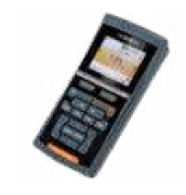
MultiLine® Multi 3620 IDS