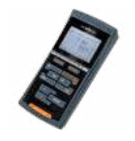
MultiLine® Multi 3510 IDS