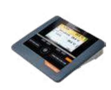
inoLab® Multi 9630 IDS

The digital inoLab® multi parameter meters for IDS sensors for parallel measurement of the same or different parameters. Up to three sensors can be connected. The IDS conductivity cells cover a wide range of applications. Due to the galvanic isolation of the measuring channels, there is no interference between the connected sensors, e.g. IDS pH electrodes.