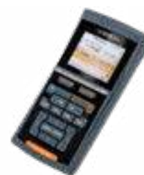
MultiLine® Multi 3630 IDS