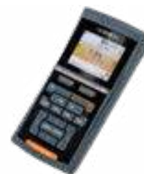
MultiLine® Multi 3620 IDS