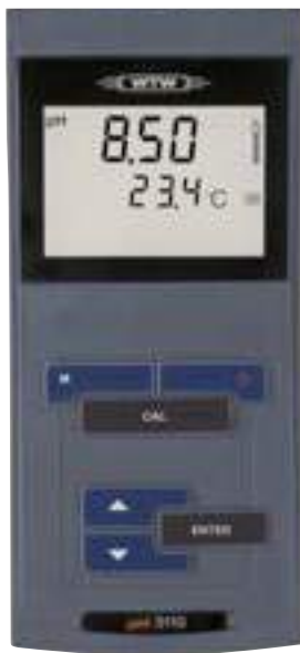
ProfiLine pH 3310