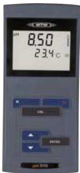
ProfiLine pH 3110