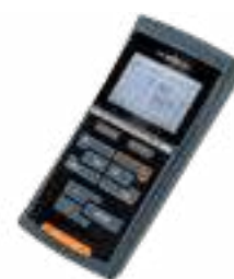
MultiLine® Multi 3510 IDS