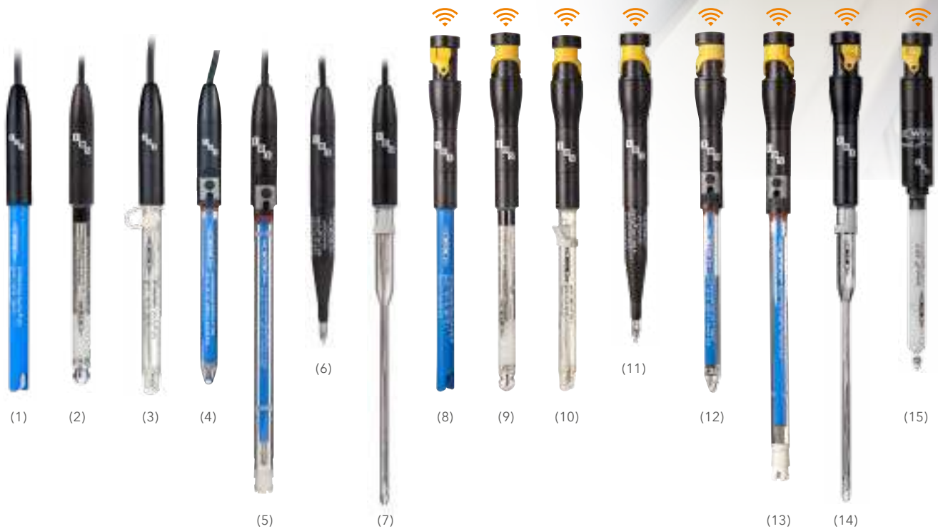
from left to right: the digital IDS sensors (1) SenTix® 940, (2) SenTix® 945, (3) SenTix® 950, (4) SenTix® 980; the IDS special electrodes (5) SenTix® HW-T 900, (6) SenTix® Sp-T 900, (7) SenTix® Micro 900; the wireless ready IDS plug head electrodes (8) SenTix® 940-P, (9) SenTix® 945-P, (10) SenTix® 950-P, (11) SenTix® Sp-T 900-P, (12) SenTix® 980-P, (13) SenTix® HW-T 900-P, (14) SenTix® Micro 900-P and (15) SensoLyt® 900-P